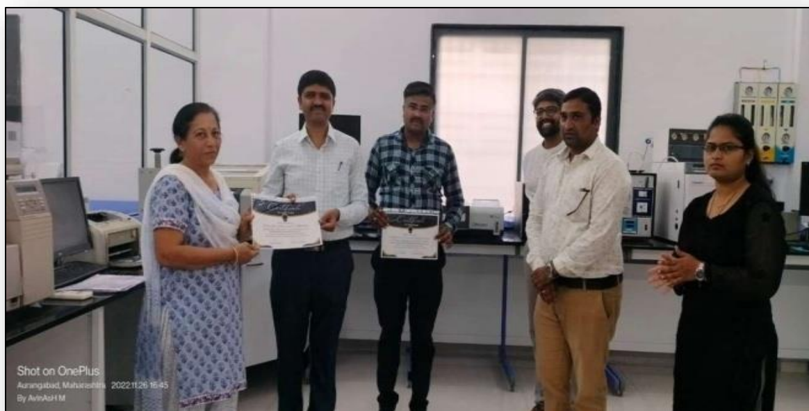
Visit at Shodh Advantech, Aurangabad.