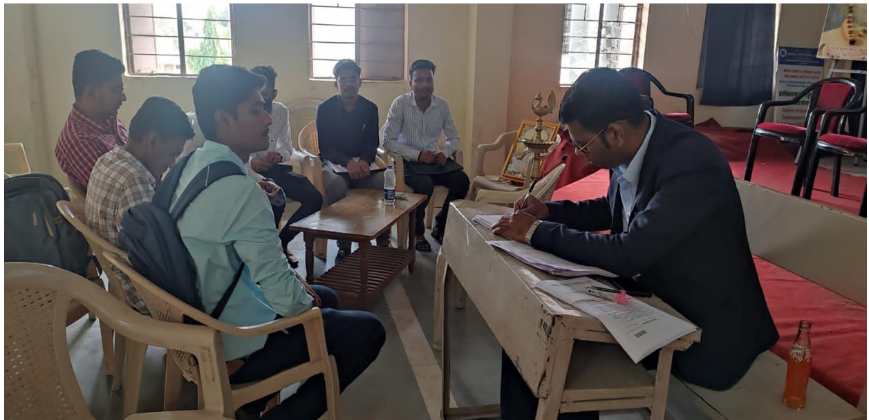
Offer letter giving to the students who are finally selected in campus