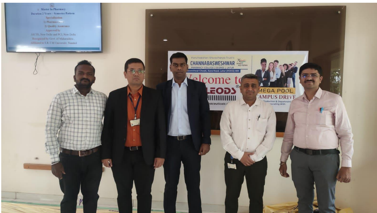
Welcome in campus to team of Macleods Pharmaceuticals by Training & Placement Dept. of Channabasweshwar Pharmacy College, (Degree) Latur.