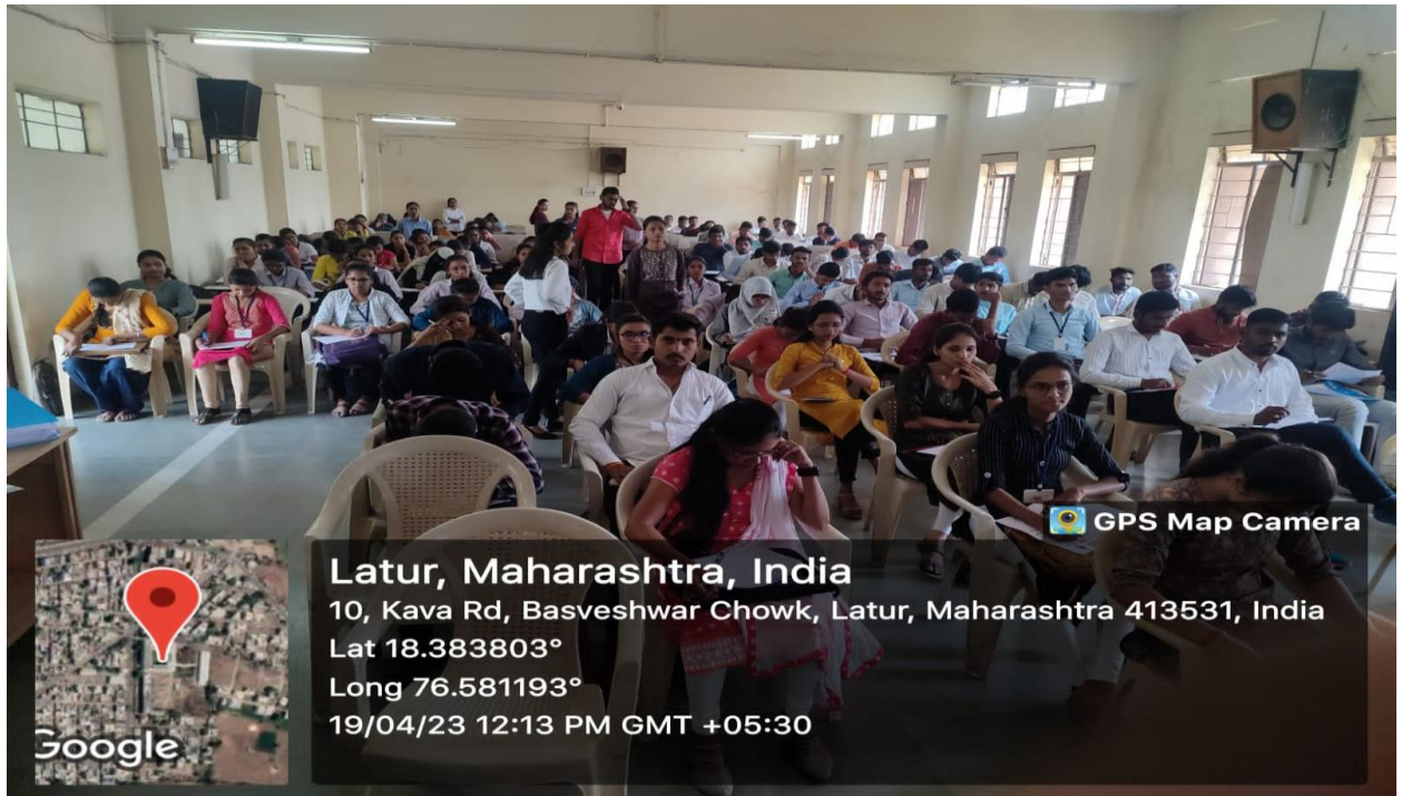
Students waiting for final interview