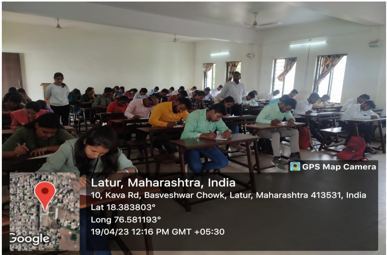
Preliminary Test conducted for Preselection of students in drive