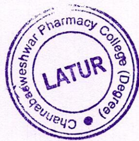
PRINCIPAL Channabasweshwar Pharmacy College (Degree) Kava Road, Latur