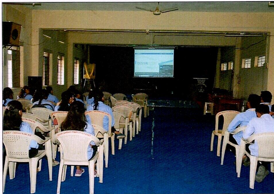
Student listening to "A demo of Stat-Ease Design-Expert V-13 Academic" on 21/01/2023