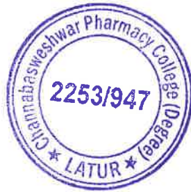
PRINCIPAL Channabasweshwar Pharmacy College (Degree) Kava Road, Latur